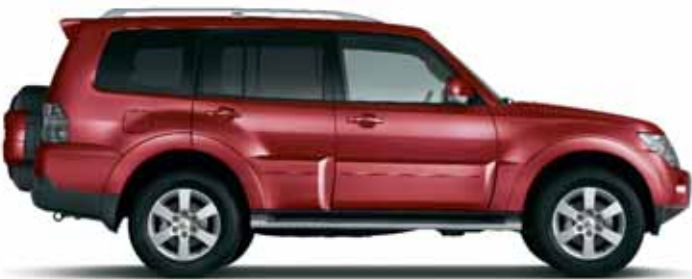
ORIENT RED (M)