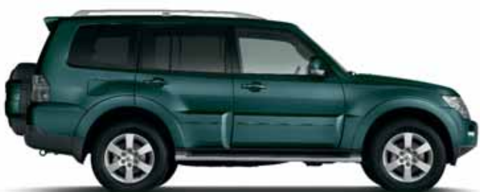
FAIRWAY GREEN (P)