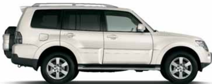
SUMMIT WHITE (S)