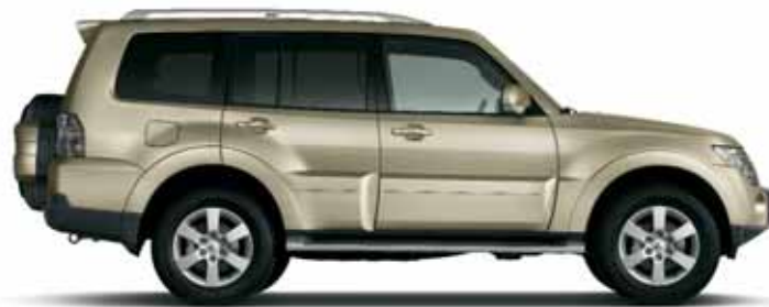
DUNE BEIGE (M)