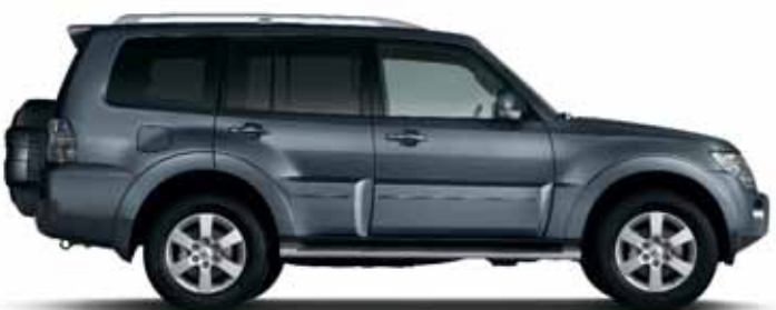
GRAPHITE GREY (P)