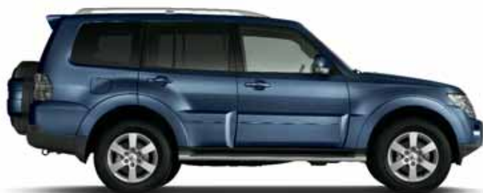
THUNDER BLUE (P)