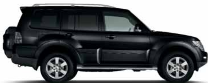
KNIGHT BLACK (P)