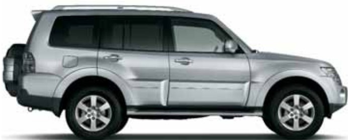
STERLING SILVER (M)